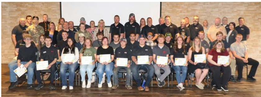
Students and employers gather for Signing Day to celebrate students entering the workforce.

As the graduating class of 2025 goes on to their next steps in life, many are entering the workforce. At the SteeleCoWorks Signing Day event, 27 students and their future employers celebrated that decision. The students are from Owatonna, Bloomington Prairie, and Medford and businesses ranged from manufacturing and trades to the military.