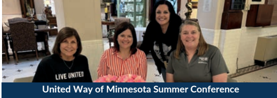
United Way of Minnesota Summer Conference