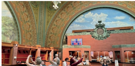
The "New Sociables" group tour