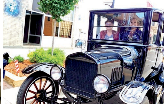
Model T Ford International at Downtown Thursday