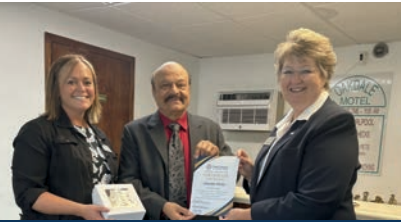
Recognizing our hospitality businesses during National Travel & Tourism Week

Be sure to follow our Facebook & Instagram pages to keep up on all upcoming events!