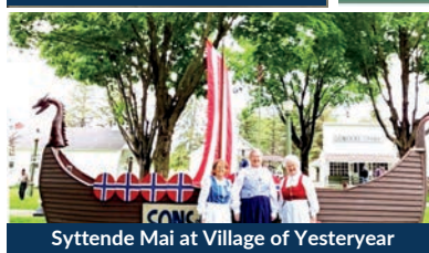
Syttende Mai at Village of Yesteryear