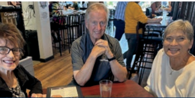
Tourism bingo at Foremost Brewing Co-op National Travel & Tourism Week