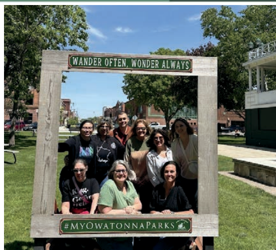
Owatonna FAM tour with Twin Cities CVB's