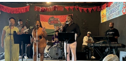
Juneteenth at Steele County Fairgrounds