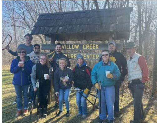
2023-2024 Class participants helped clean-up Willow Creek Nature Center as part of their "Class Project" this spring.