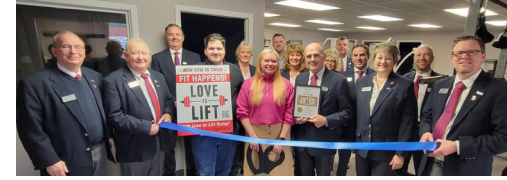
Love to Lift Ribbon Cutting