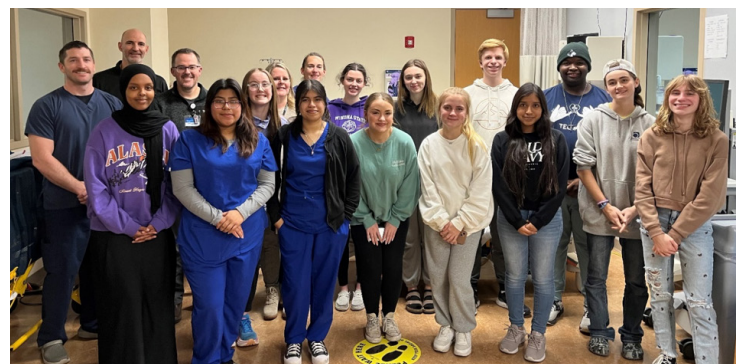
Students interested in Healthcare Careers also have the opportunity to attend SCRUB Club.

Career areas covered to date include Natural Resources Conservation Services, Real Estate, Health Sciences, Certified Public Accountants, Engineers, and Dental. Upcoming areas in January include Chiropractor and Mechanic/HVAC, Heavy Equipment, Central Farm Services, with more to follow.