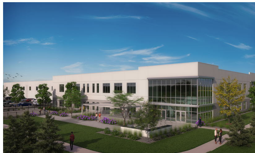
Climate By Design International