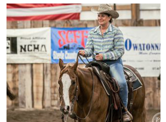
National Cutting Horse Event

United Way, Governor's Pheasant Opener, National Cutting Horse Association Events and Model T Convention