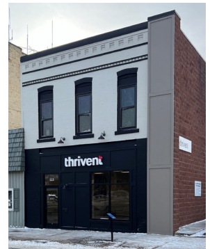
Thrivent Facade Updates

Main Street, along with EDA, allocated $105,250 in Forgivable Loan funds for 8 downtown projects. Check //owatonna.org/mainstreet for updates on funds available in 2024.