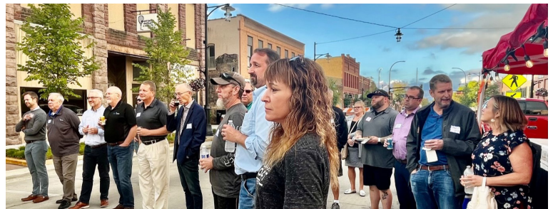
Urban Loft Business After Hours