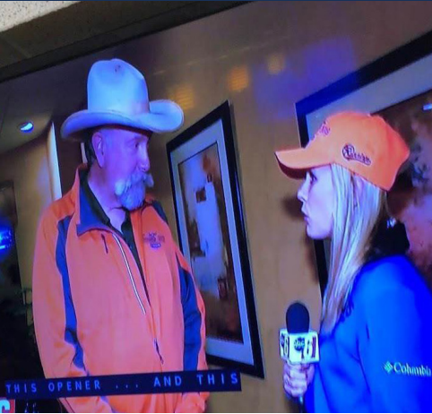
News reporter conducts a live TV interview at a previous Pheasant Opener!