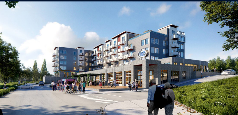
Ascend Riverfront Project