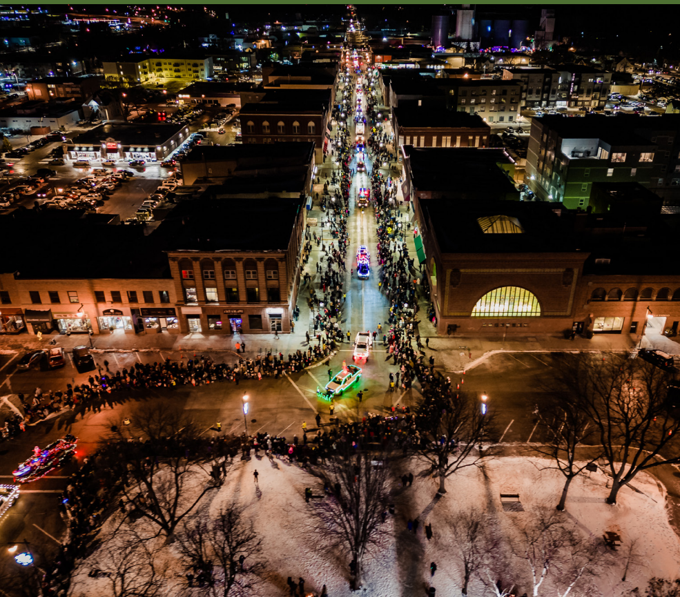
A bird's eye view of the Holiday Lighted Parade along North Cedar Avenue in December 2022.