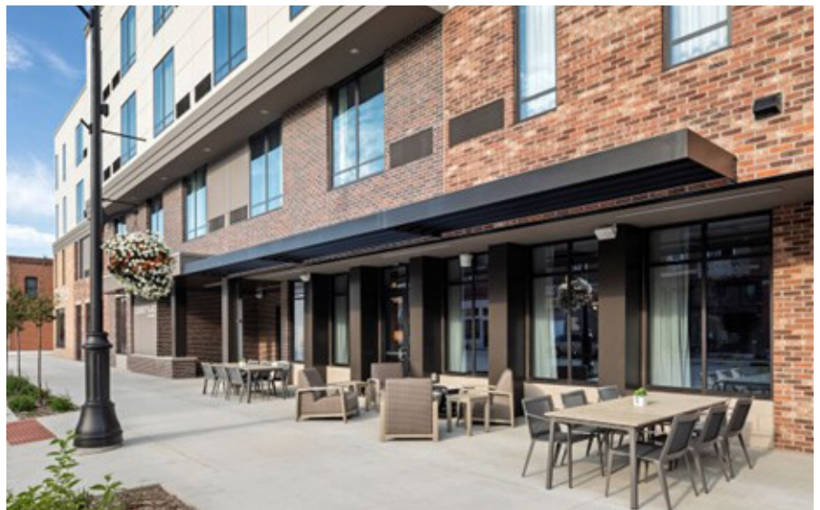
Courtyard by Marriott Owatonna Downtown location

Owatonna MainStreet was also commended on the efforts made during construction to continue to drive customers downtown to businesses. Communicating with the business owners and the public about timelines, upcoming road/sidewalk closures, and how to navigate around the MainStreet District was very integral to the outcome along with keeping a positive attitude throughout the process. Thank you to everyone who had a part in the amazing growth of Downtown Owatonna!