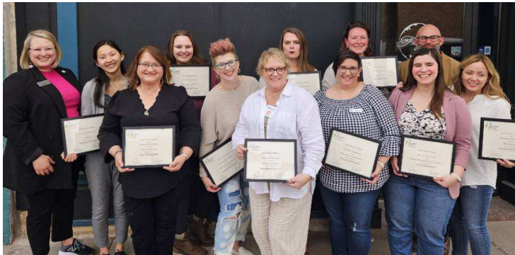
Accredited MainStreet Directors that were at MN MainStreet Conference