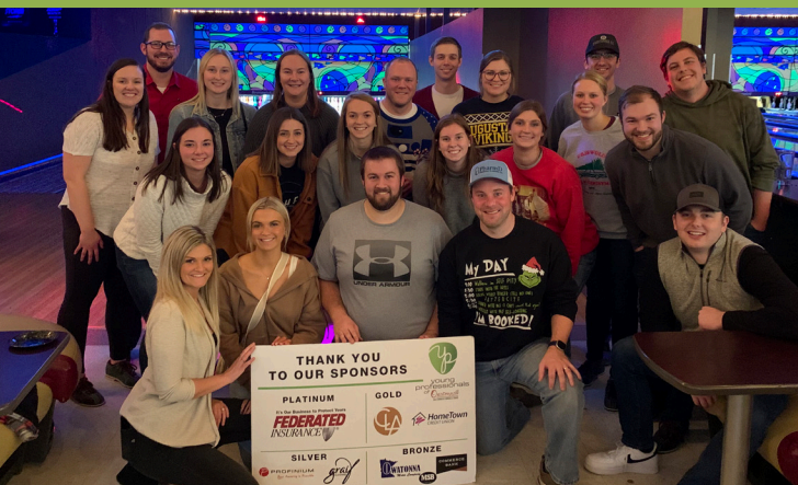
Thank you to our 2022 Sponsors! (End of the Year party. SpareTime Entertainment.)