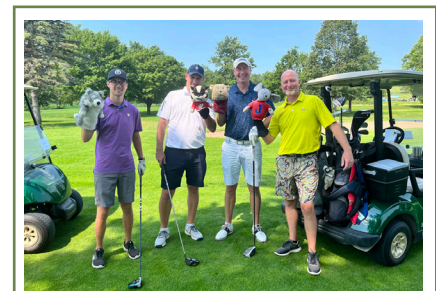
Chamber Golf Event attracted a full course (see full list of sponsors in the insert)

• New Member Orientation Meeting-Chamber membership director not only brings business in to the chamber, but also makes sure they understand how to engage with it.