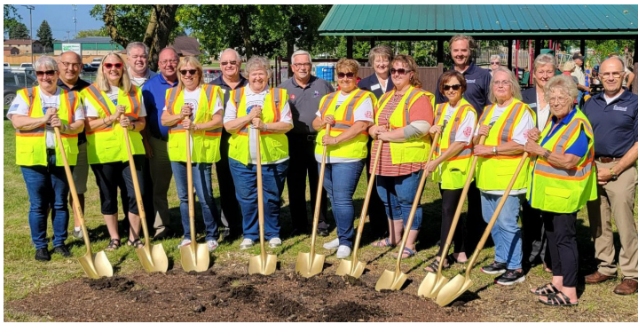
Veteran Memorial Groundbreaking-Chamber Ambassadors celebrated with the Moonlighters Exchange Club and VFW as the ground was broken on this important veterans recognition.

Groundbreaking on new 200,000 sq ft CDI Building -locally founded and owned Climate by Design International started the next phase of their growth.