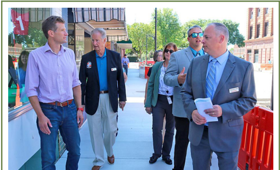
DEED Commissioner Grove Visit Owatonna-The Chamber worked with state officials to have Commissioner Grove talk workforce in Owatonna, Governor and Lt Governor decided to join.

• Learn to Earn Committee Starts Efforts on Higher Ed-Chamber is coordinating this committee with Riverland and Owatonna Schools to understand the higher ed needs of the area.