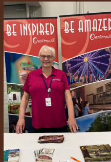
400 tour coordinators attended the MN Field Trip Library Expo