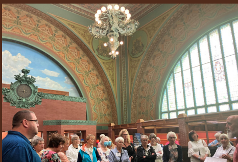
Approximately 150 people came to Owatonna in August with 5 different Group Tours