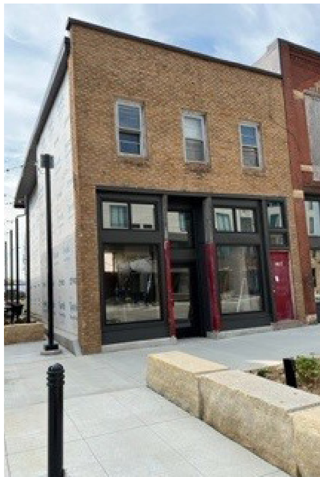
Renovation taking place at 214 N. Cedar, Owatonna.

https://engageowatonna.com/downtown-owatonna