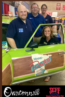
The VIP Tour Group saw a full day of Owatonna highlights