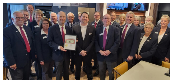
Hotel Cuts Ribbon and Opens Doors Downtown-A big ribbon cutting at Courtyard followed by MainStreet's Downtown Thursday created an exciting atmosphere downtown.

• Policy Committee meets with City, County on Budgets-the Chamber committee met with both city council and county commissioners and staff about budget plans for 2023.