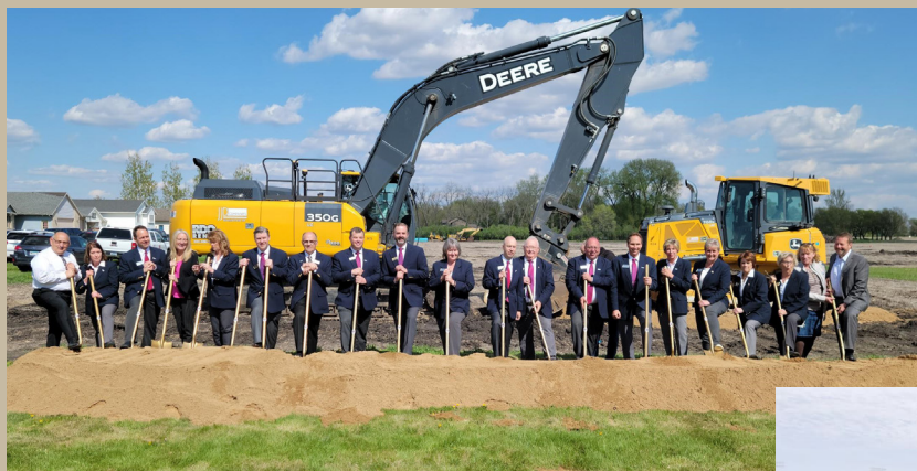
Ambassadors took part in the new high school groundbreaking ceremony.