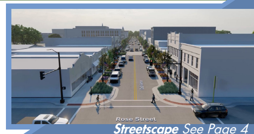
Streetscape See Page 4