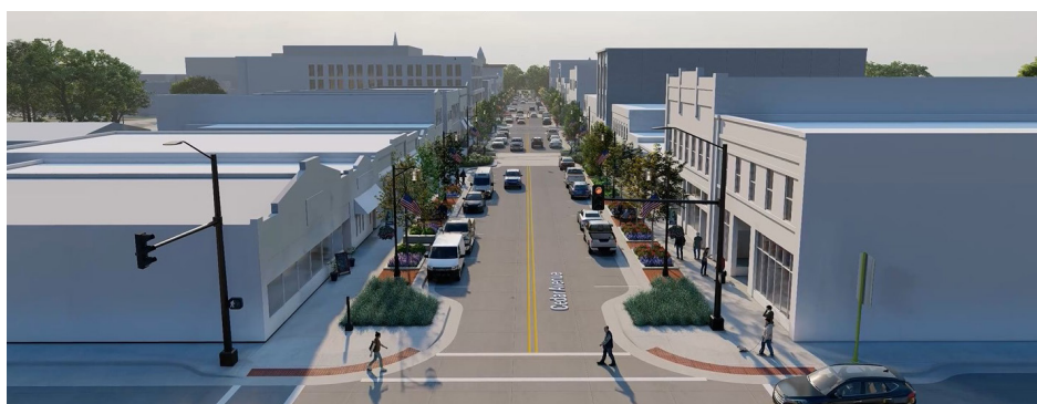
Architect rendering of new streetscape.

With close to $30M being invested in downtown this summer, a major transformation is underway. Private investment, coupled with public improvements, will equal an incredible change.