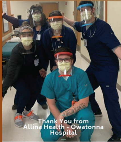
This week 61 face shields were delivered to Allina HealthOwatonna Hospital

Thank you Federated Insurance, Viracon, Poly Plastics, FoamCraft Packaging, Cindy's Tailoring, Alterations & Dry Cleaning and Mineral Springs Brewery!