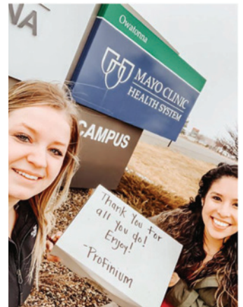
Profinium's Owatonna crew delivered some Old Town Bagels to our medical heroes this week!

Cash Wise Foods is committing financial support to local food shelves during this critical time. Join them by contributing when you check out!