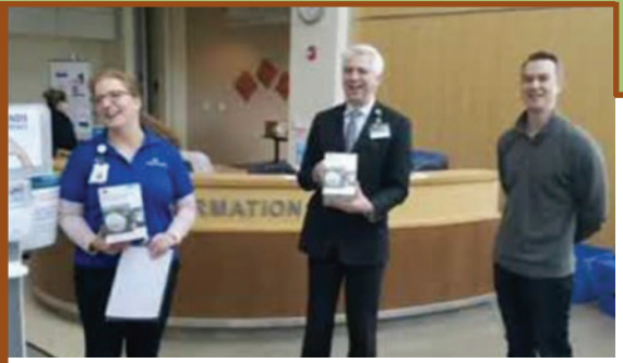
On Monday, March 23rd Black Forest LTD donated N95 masks to Mayo Clinic Health System