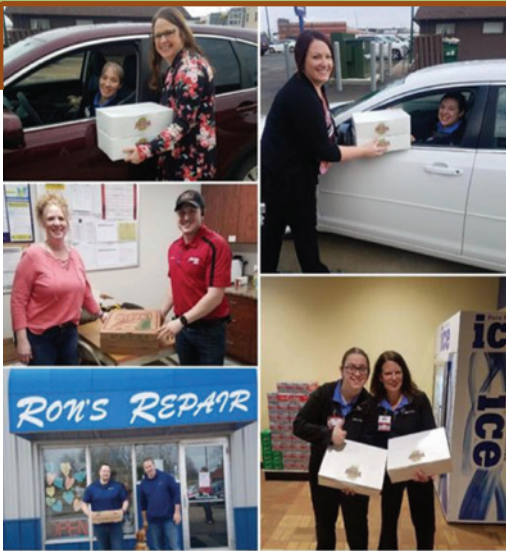
The local U.S. Bank Owatonna Team was out delivering lunches to help support all of those working on the front lines of our community!

RE/MAX Venture Owatonna have teamed up with the owners of Old Town Bagels to provide free lunch for Nurses, Doctors, Fireman, Ambulance EMT, Deputy Sheriff, and Police!!