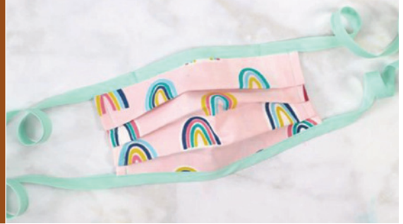
Thank you Cindy's Tailoring, Alterations and Dry Cleaning for helping make masks for our health care professionals!