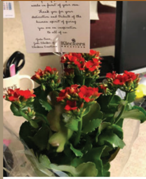
A big shout out to Kleckers Kreations for delivering 115 beautiful plants and inspiration cards to our front line medical works at Allina Health Owatonna Hospital and Mayo Clinic Health System.