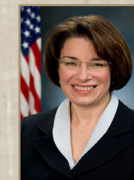
Senator Amy Klobuchar (D) 202-224-3244