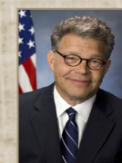
Senator Al Franken (D) 202-224-5641