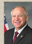
District 1 Congressman Tim Walz (D) 202-225-2472